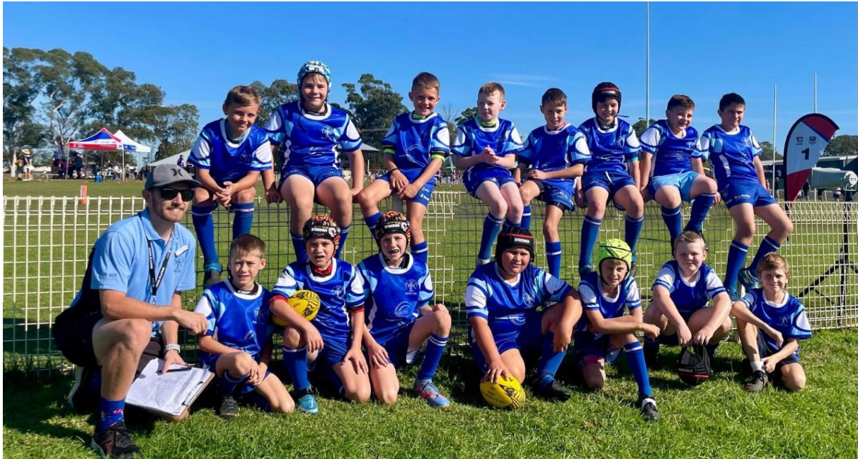
Stage 2 Football Gala Day held in Cessnock last week.