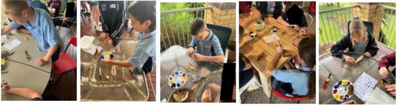
Year 7 Aboriginal and Torres Strait Islander Transition Day on Tuesday 28 th of November