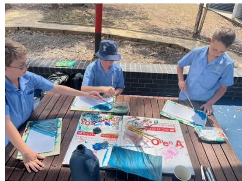
Year 4 Art Project